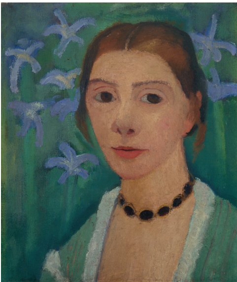
PAULA MODERSOHN-BECKER, Self-Portrait before a Green Background with Blue Iris, 1905, oil tempera on canvas. Kunsthalle Bremen – Der Kunstverein in Bremen.

For the chance to have your work displayed on-site at Neue Galerie New York, your submission must be received by Monday, June 17, 2024 at 6 P.M. ET . Submit your drawing by mail (Attn: Visitor Services, Neue Galerie New York, 1048 Fifth Avenue, 10028) or drop it off at the Membership Desk during regular museum hours. Submissions must include the artist’s name, age (children), and contact information (see form attached). For those age 17 and under, a consent form (see form attached) completed by a parent or legal guardian is required. There is no submission fee. Please note that only those whose works are chosen for display will be notified and that art work will not be returned.